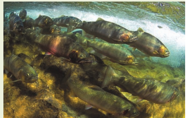
PRINTED ON 100% POST-CONSUMER, CHLORINE-FREE PAPER WITH SOY-BASED INK

According to a recent report by our partners at the Santa Cruz County Resource Conservation District, farmers in Santa Cruz County are protecting the health of local streams and endangered fish like never before. The reason? Partners in Restoration (PIR). The program simplifies the complex and costly regulatory process landowners face when restoring their properties and waterways flowing through them. Over the last two years, PIR participants in Santa Cruz County stopped nearly 20,000 tons of sediment from polluting ecologically rich streams in eight county watersheds. Besides dramatically reducing silt that clouds streams and the future for endangered coho and steelhead salmon, fish benefited from the removal of barriers that interfered with their natural migration and successful breeding. By the end of 2008, landowners hope to prevent another 1,000 tons of sediment from washing downstream.